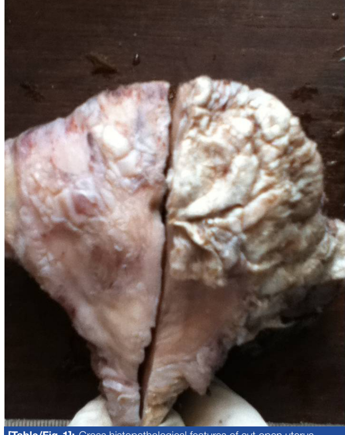
[Table/Fig-1]: Gross histopathological features of cut open uterus specimen

The gross examinations of the uterus and the cervix were unremarkable. The posterior surface of the uterus was covered with white flakes [Table/Fig-1].